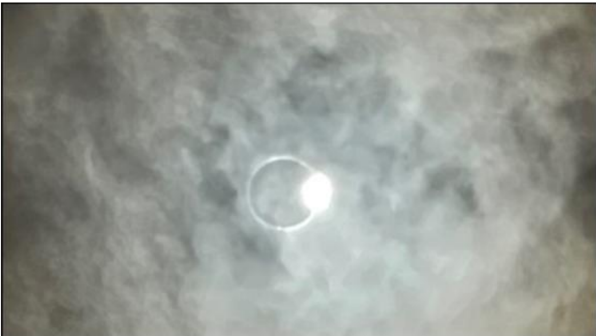
No better fun for $2.00: the Monday social club viewed the April 8 total solar eclipse after coffee, tea and treats.